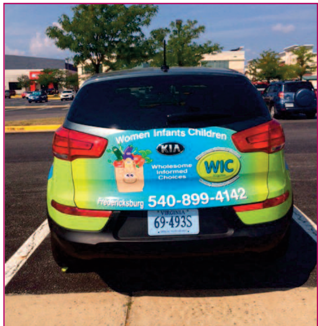
WIC MOBILE — Eye-catching images will help participants spot the WIC-mobile when it is on the road.

Since Virginia's WIC Program uses Electronic Benefit Transfer (EBT) cards as opposed to paper vouchers, staff members can perform WIC certifications outside of the traditional on-site clinics. The WIC vehicle will transport laptops and tables to different community organizations such as libraries, day care centers, apartment complexes, and community events. Interim WIC Coordinator Christy Redmond used the services of Signs 4 Less in Fredericksburg, VA to wrap the vehicle in color-