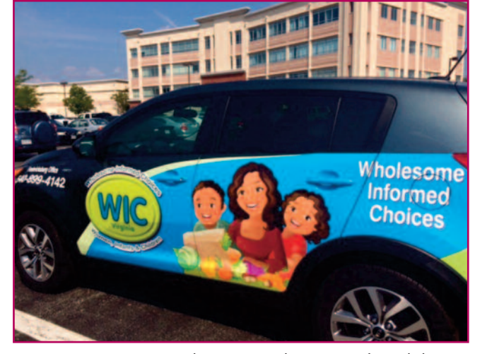
CAN'T MISS THAT — The creative designs are fun while also informative.

ack of transportation is always a barrier to delivering WIC services to the public, and even with public transit systems, many WIC participants struggle to make it to the WIC office for their appointments. Virginia's Rappahannock WIC Program found a solution to this problem and used outreach funds to purchase