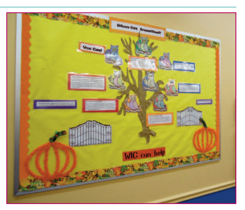
WHOOO CAN BREASTFEED? — Informal educational opportunities such as bulletin boards are a cornerstone of breastfeeding promotion in all Mid-Ohio Valley WIC clinics.

Our breastfeeding women represent approximately 3% of our clientele. As a 2016 outreach goal, the MOV WIC Program would like to raise that number so more women and babies can enjoy the benefits of breastfeeding. Fully breastfeeding women not only enjoy a larger WIC food package, but receive a fruit infusion cup at certification to prevent dehydration which can affect milk supply. At the six-month follow-up visit, fully breastfeeding babies enjoy a bib proclaiming that mom provides the best nutrition possible.